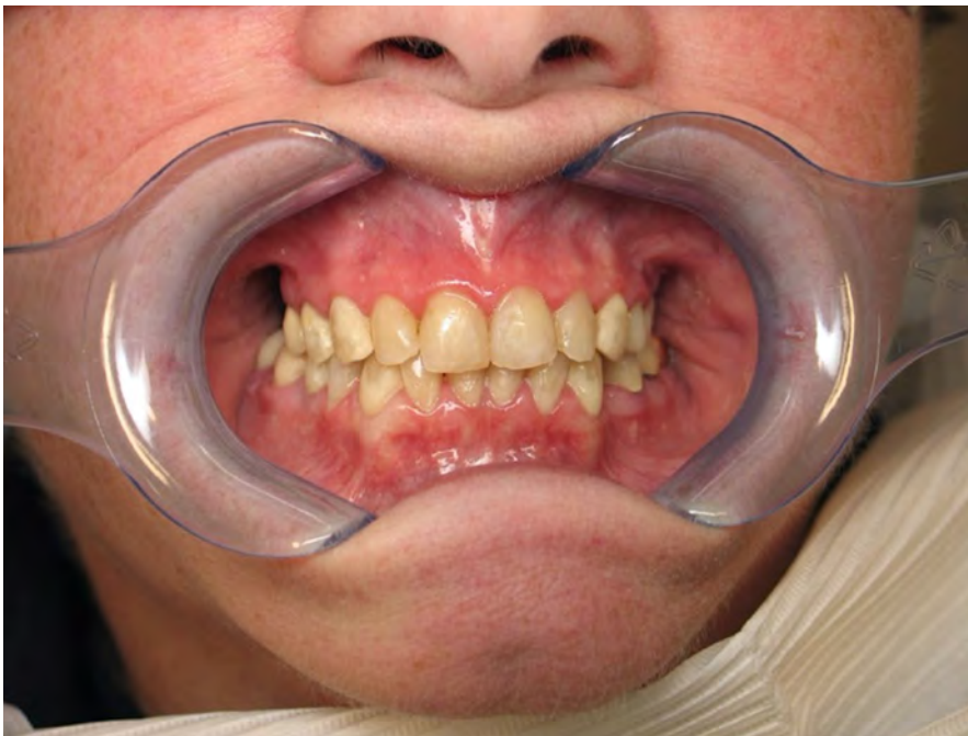
Figure 8 — Clinical presentation of the patient’s dentition after restorative treatment with resin modified glass ionomer and conventional glass ionomer.